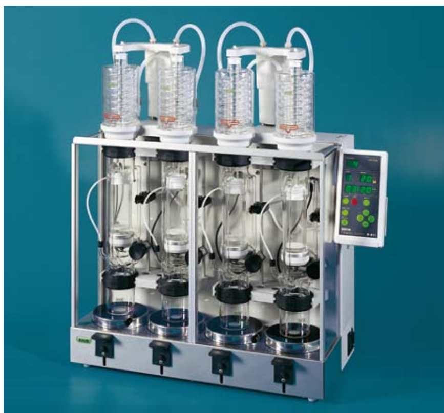
Figure 1: Extraction Unit B-811

the rinsing step, and a blank reading control was carried out to ensure that the extraction apparatus did not contain any contaminants.